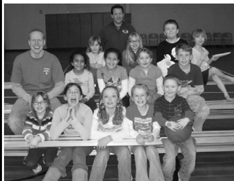
Buckets of Hope for Haiti

Great times, Great experience, great mission!!