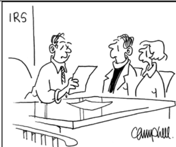
"I see you've laid up for yourselves treasures in heaven. Is this some sort of tax dodge?"

UPWARD PRACTICES HAVE BEGUN. SUPPORT THIS MINISTRY WITH YOUR PRAYERS AND YOUR ATTENDANCE. GAMES BEGIN FEBRUARY 6.